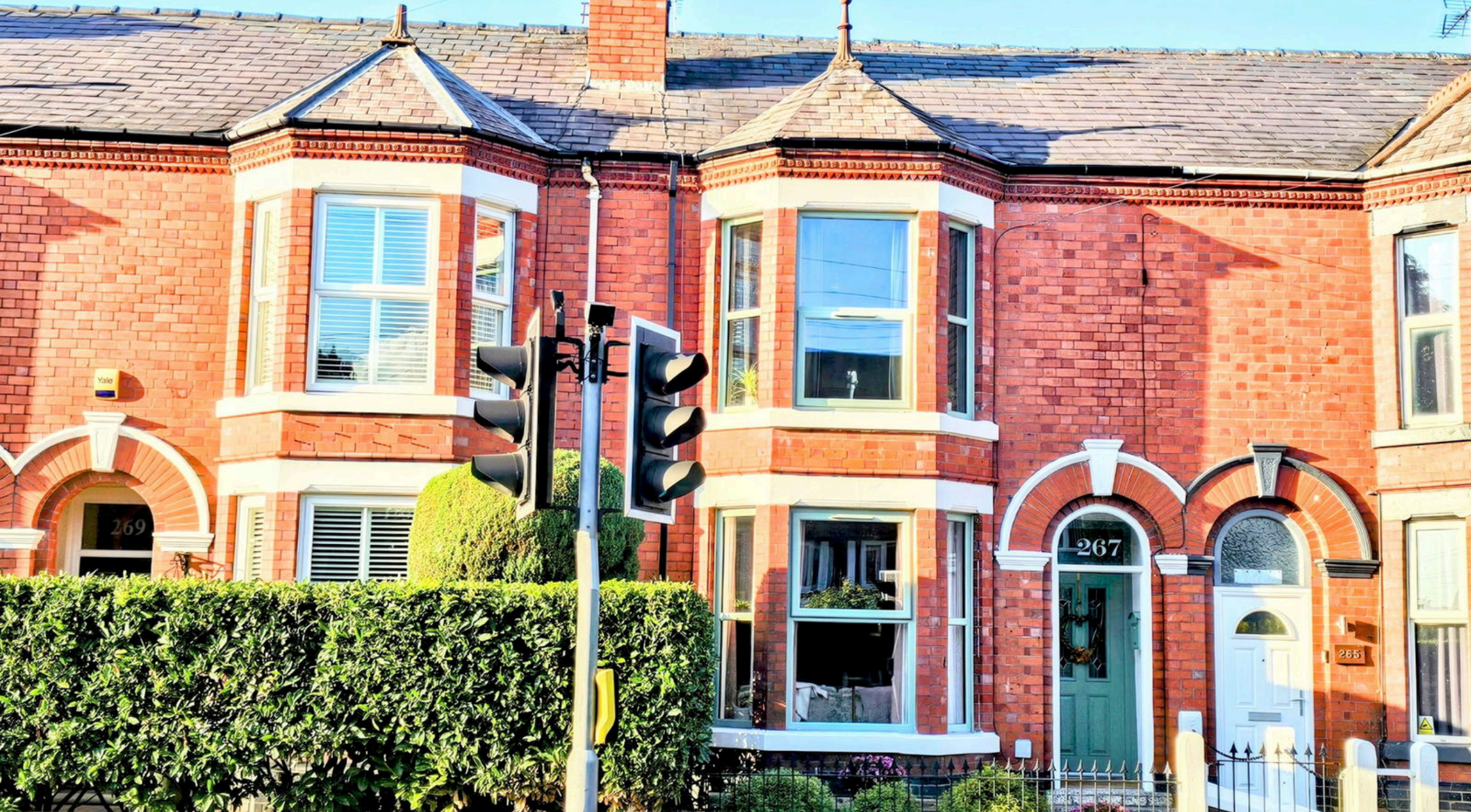
Nantwich Road, CW2